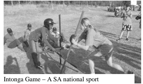
Intonga Game – A SA national sport

The second game was Intonga (Stick-game) played by two people each having a stick, shield and a helmet. Two judges took a score and a ref counted the minutes. Next week there will be a national competition in this game; South Africa has a national league too. It was used to be deployed as a defence and still nowadays it can function as training for defending.