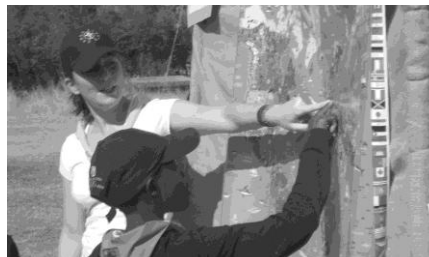
Finding "Deutschland" on the world map

Scout's Association is called: dpsg (Deutsche Pfadfinderschaft St. Georg). After the Vocabulary practise and some speeches about German Culture