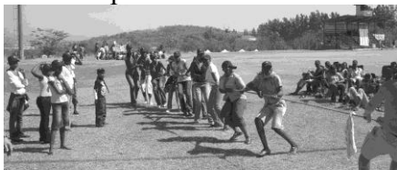
Pull! Pull! Pull!

The Tug of War was invented by the English Royal Navy in the 16th Century as in contest between ship's crews.