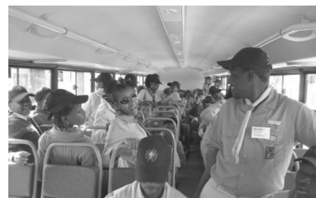
Getting to the different locations by bus

We visited an old people's house called SAVF Herfrakker Ouetehuis, accommodating about 85 old people. Our scouts were singing and dancing for them, so that nurses, workers and of course the old people themselves were absolutely impressed. They say: THANK YOU SCOUTS!