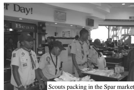
Scouts packing in the Spar market

wonderful Scouts were absolutely friendly and helpful. People were curious and wanted to know more and more about Scouting in langa and worldwide. A great opportunity to show who we are!