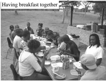
Having breakfast together

Whistles blew indicating for our flag break to bless the new day.